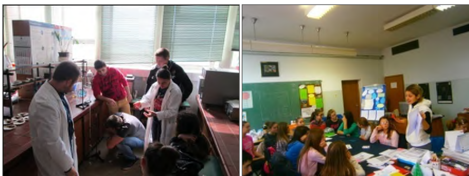
Pictures 1 and 2. Preparatory workshops for students and partner institutions

2. Preparing students to perform experiments, demonstrations, presentations at scientific events - the implementation of preparatory workshops in partner institutions (Pictures 1 and 2)