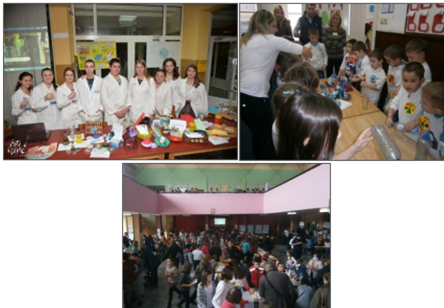
Pictures 3-5. Scientific Festivals – students as a science promoters and visitors as active participants

CPS's program "Planetarium", etc. Through interactive contents and scientific quizzes the active participation of visitors in scientific activities is ensured (pictures 4 and 5).