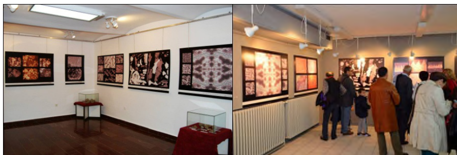
Pictures 6-8. Scientific exhibition "Secret world of metals and minerals" at Museum of Mining and Metallurgy in Bor

5. Media campaign – project activities are followed and reported by all media in East Serbia, as well as through internet portals, networks and sites.